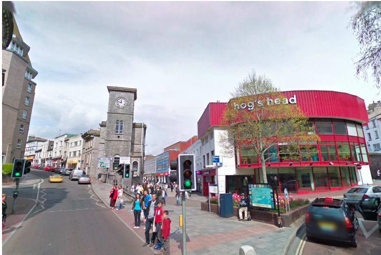
Picture 1 – Note you can see the residential accommodation on the right hand edge of the photograph